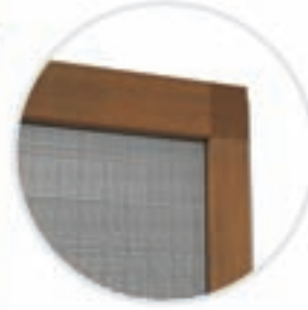
Frame with with an external corner insert and a side seal