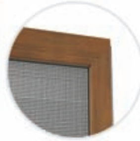
Frame with an internal corner insert and a side seal