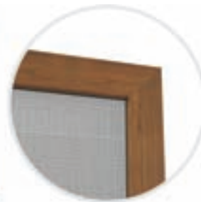
Frame with an internal corner insert