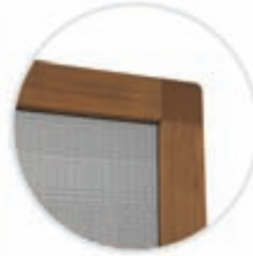
Frame with with an external, plastic corner insert